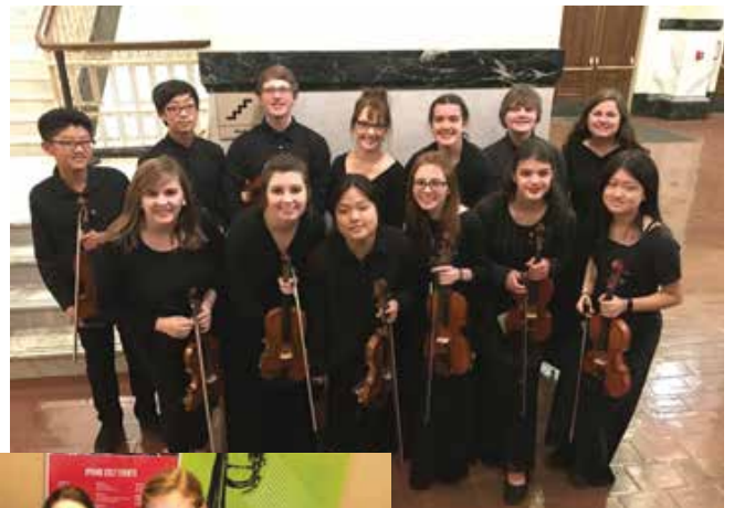
(Above) Violin Ensemble performing at PRISM in Van Meter