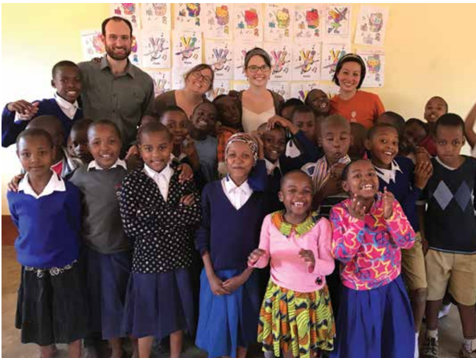
First and Second Year Majengo Primary School Students