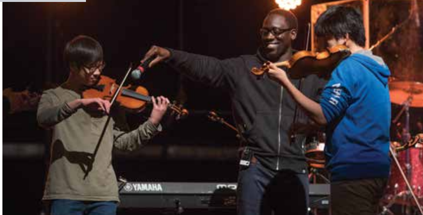
Black Violin Masterclass