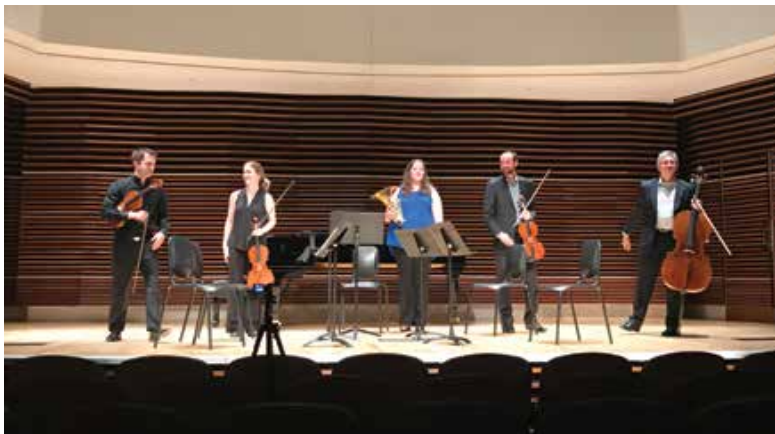
University of Tennessee Chamber Music Concert