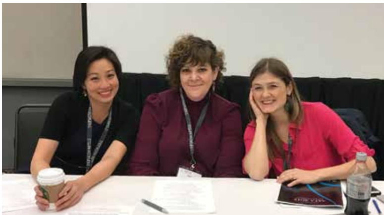
2017 American String Teachers Association Pedagogy Panel: Building a Successful University Studio Conference