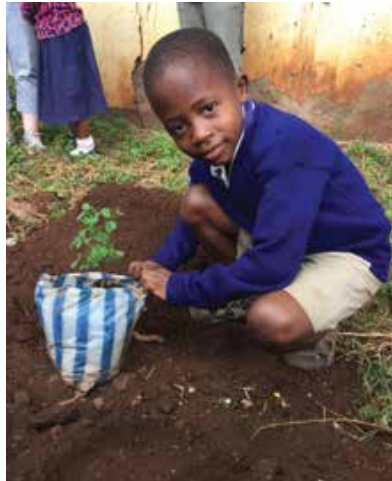
Mpingo Tree Planting at Majengo Primary School

Our days were also full of singing and games for the children to engage in body movements and hearing pitches. The Sunflower Song and Twinkle with solfege and motions as well as the children’s song Che Che Koolay became favorites among the two violin classes. The kids also loved ear-training exercises. We would tell them Funga macho , Swahili for “close your eyes.” They did close their eyes and they listened. Several excited voices would exclaim at once what note they heard played on the violin. Even after repeating many of the same activities