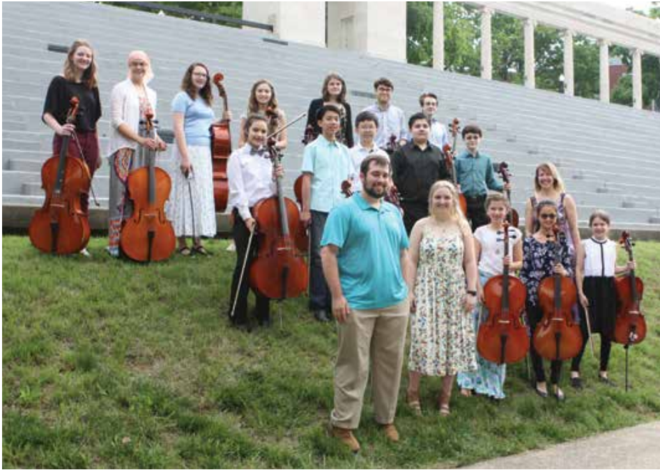
Spring 2017 Cellobration