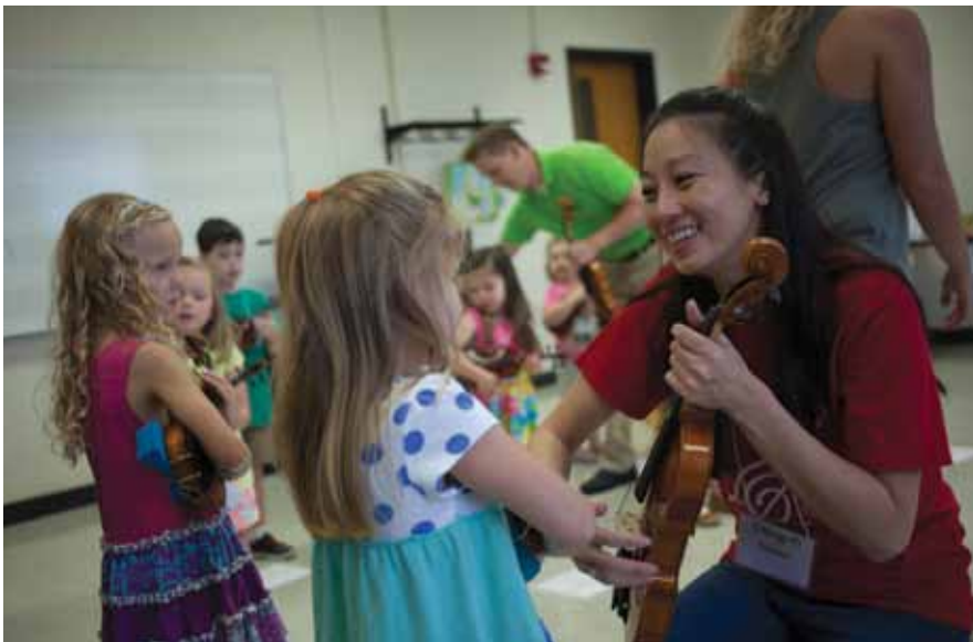
String Explosion Violin Twinklers