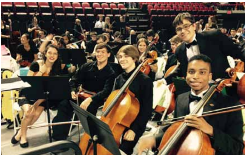
Pre-College students performed at the String Finale Concert