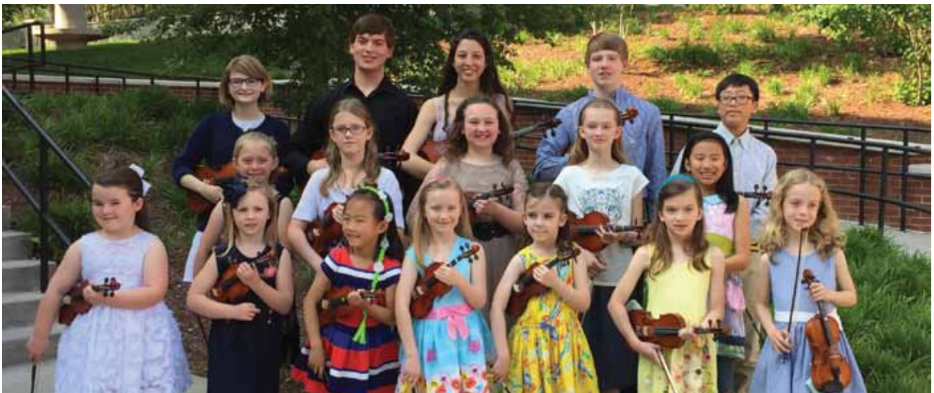
Vivaldi solo recital