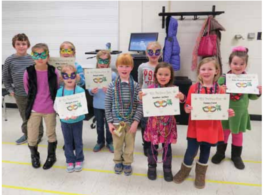
Violin Beginner B Practice-A-Thon Winners